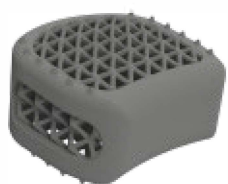
BMD Titanium ACIF Implant