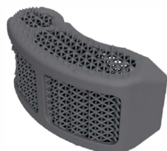
BMD Titanium TLIF Implant