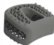
BMD Titanium ACIF GW Implant