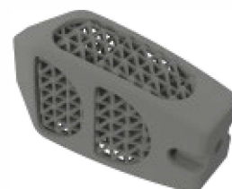
BMD Titanium PLIF Implant