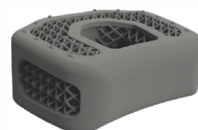
BMD Titanium ALIF Implant

Implantes de fusão intervertebral Global Titanium® impressos em 3D.