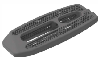
BMD Titanium LLIF Implant