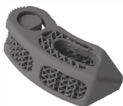
BMD Titanium TLIF GW Implant