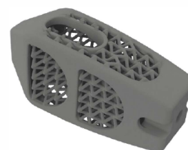
BMD Titanium PLIF GW Implant